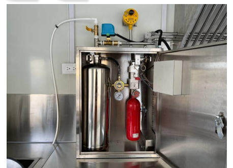
- Fire Suppression System -