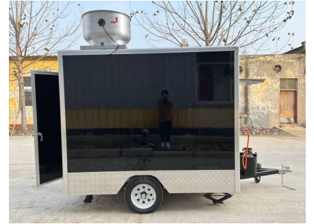
- Rear -