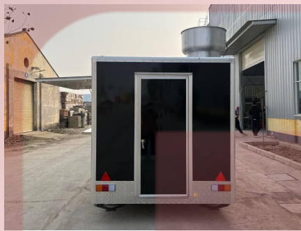
- Door -