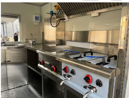
- Cooking Equipment -