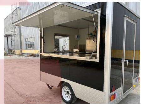
- Window -