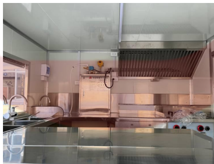
- Inside -